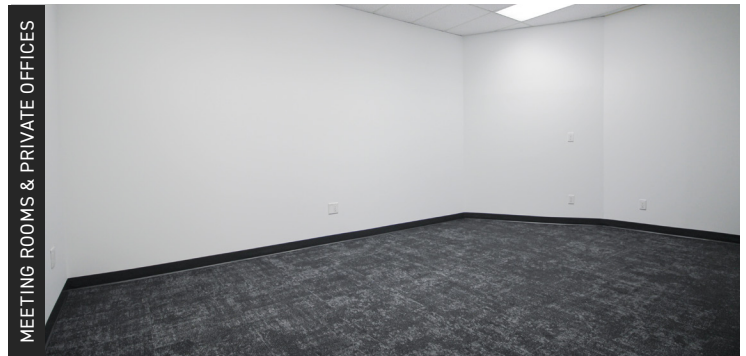
MEETING ROOMS & PRIVATE OFFICES